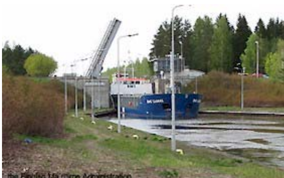
the Finnish Maritime Administration

The City Councils of Kotka and Hamina decided on 8 November 2010 in their respective meetings that the port companies of Kotka and Hamina will merge. The new HaminaKotka Satama Oy will begin its operations on 1 May 2011. With this merger, the largest general and export port in Finland will be created in the Kymenlaakso region. Among the 250 ports of the Baltic Sea, HaminaKotka Satama will rise approximately to the 15th position and it will be the third largest container port. The role of the new port company will strengthen in the Gulf of Finland and the Baltic Sea as well as in transports to and from Russia. Decision-making in the new port supports the industrial and commercial activities of the entire region and makes it easier for companies to establish themselves in the region.